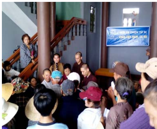
(Gifts to buy seeds, in the US An Commune, Hoai An District, An American social and seal 200. An Hao Commune East)